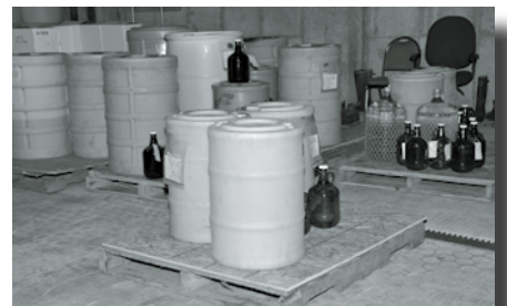
Part of the "mountain" of small containers