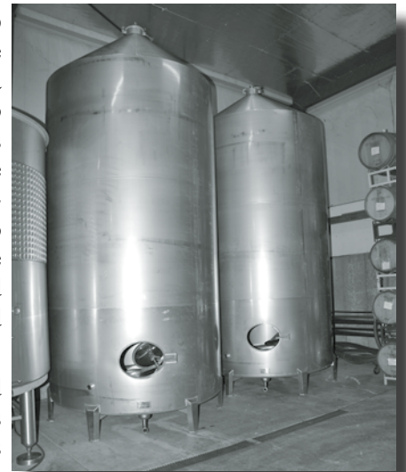
Two new 5000 gallon fixed volume tanks

Prior to that, we used plastic drums and glass jugs of various volumes to contain the "excess" wine, resulting in a mountain of small containers scattered throughout the winery. Obviously, this change will be a huge improvement in terms of labor and wine quality!