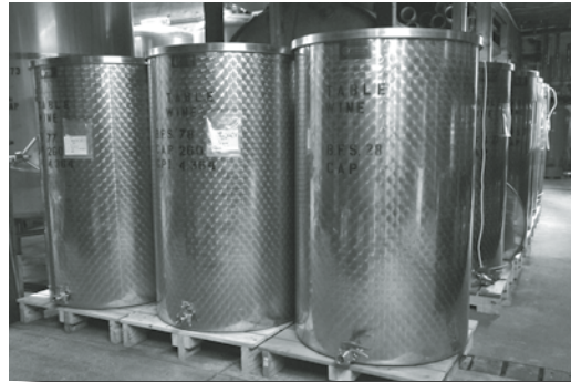
260 gallon variable volume tanks

The variable volume tank design is a relatively new concept. Essentially, it is a giant open-topped cup, being a straight wall vertical tank with a disk shaped lid that slips snugly inside of the tank. After the wine is pumped into the tank, the lid is lowered